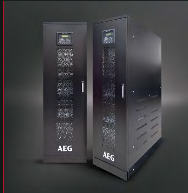
Protect PLUS S500 3-phase UPS 30 – 200 kVA

Protect PLUS S500 has a Dynamic Charging Mode (DCM). From 60 kVA, Protect PLUS S500 UPS can be installed with a larger charger for use with higher capacity battery sets required for long autonomy times.